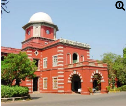
Anna University Building, Guindy.