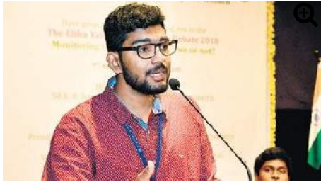
A student participant at the debate